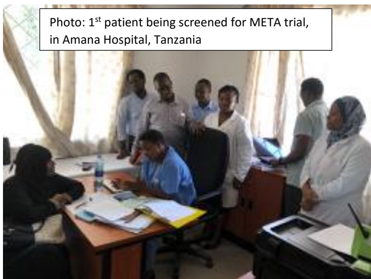
Photo: 1 st patient being screened for META trial, in Amana Hospital, Tanzania