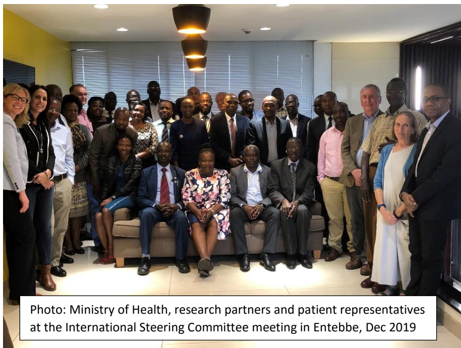
Photo: Ministry of Health, research partners and patient representatives at the International Steering Committee meeting in Entebbe, Dec 2019

EDCTP has agreed to fund a phase 3 trial of metformin in Tanzania. Merck have agreed to supply the products again.