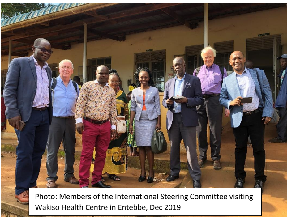
Photo: Members of the International Steering Committee visiting Wakiso Health Centre in Entebbe, Dec 2019

Submissions were made to the NIHR Global Health Policy & Systems Research to expand to evaluating community care and to the NIHR RIGHT Call 3 to optimise the integrated model to include depression.