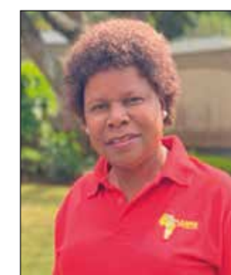
Professor of Nursing (Reproductive Health), Kamuzu College of Nursing, University of Malawi

Reflecting on the four years, I believe that midwives, as primary caregivers, are well placed to address important healthcare issues, and as Chair of LAMRN I want to thank everybody involved for their passion and commitment.