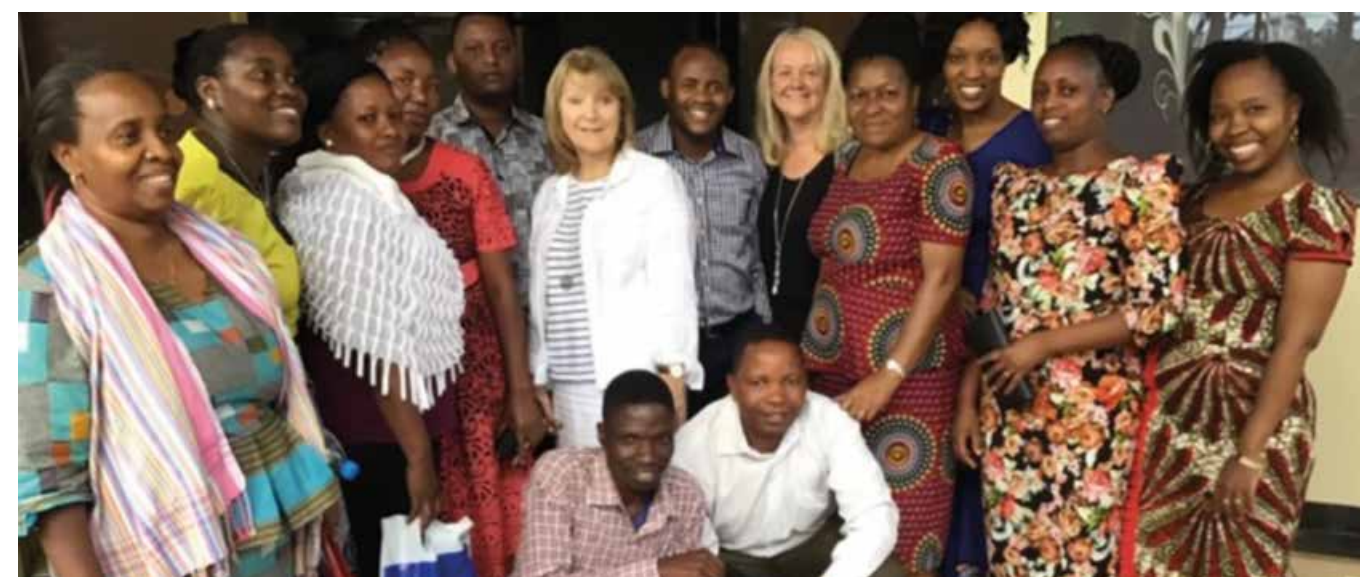
Stakeholders from Tanzania with UK colleagues