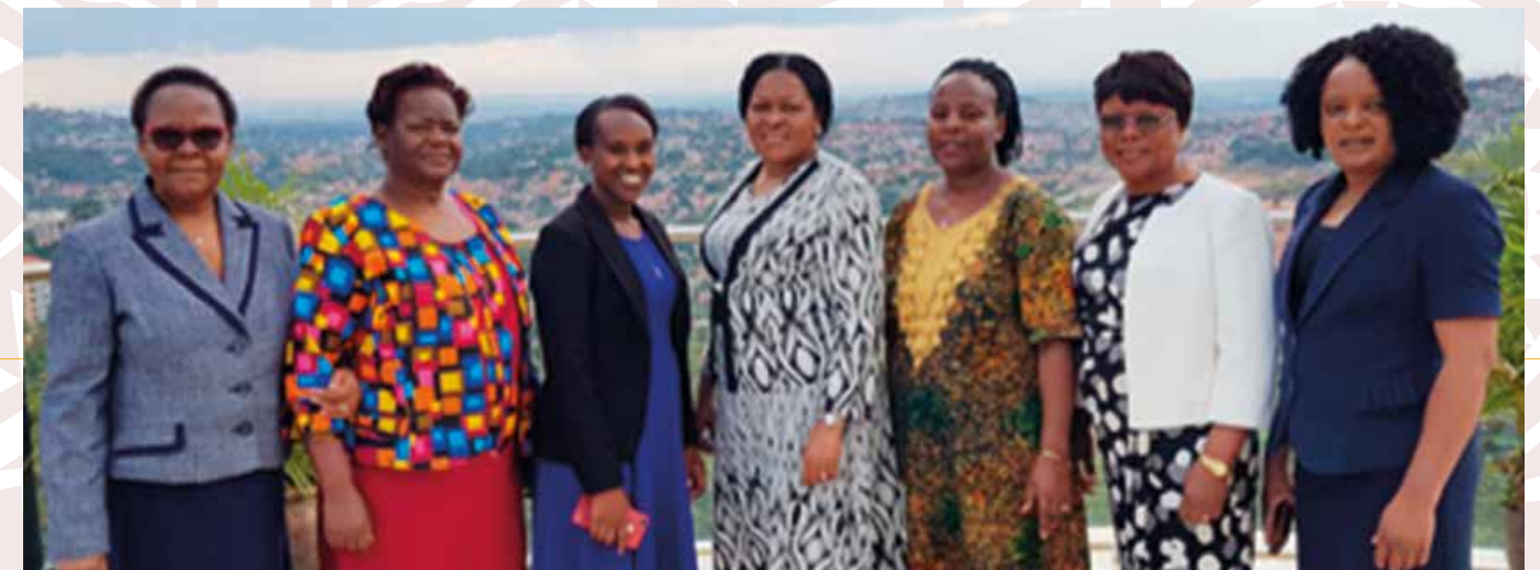
Research and Country Leads at the annual meeting of the Stillbirth Group in Uganda