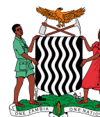
REPUBLIC OF ZAMBIA MINISTRY OF HEALTH