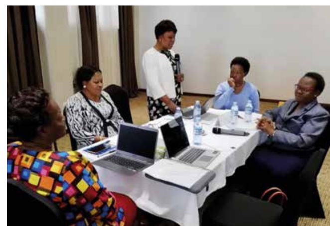
Country Leads and Africa Research Coordinator at research planning workshop in Uganda

I'm so grateful to be part of this NIHR group whose desire is to see midwives develop as good scholars and practitioners. It has opened doors for me within the maternal and newborn health care sector through our stakeholder engagement and I have grown as a researcher and academic thanks to the mentorship and collegiality provided by the knowledgeable UK team.