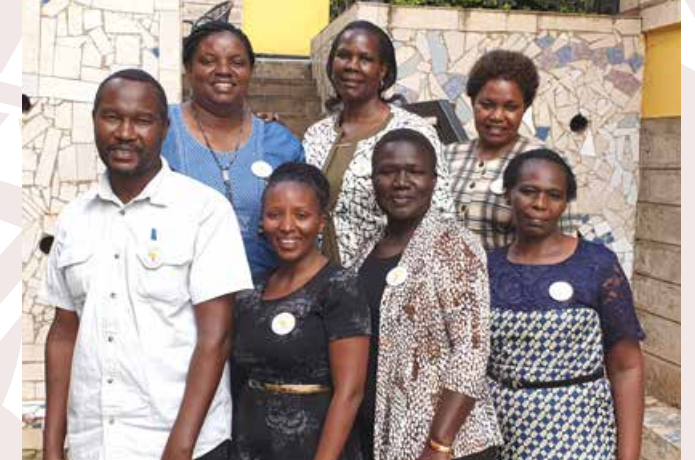
Bereavement champions and peer supporters from Kenya