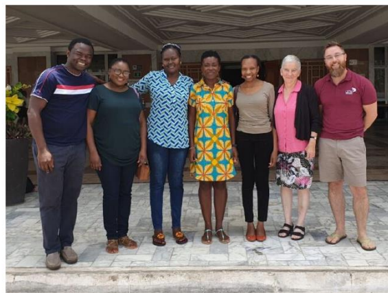
Some of the LRP team at the DELTAS Africa AGM 2019