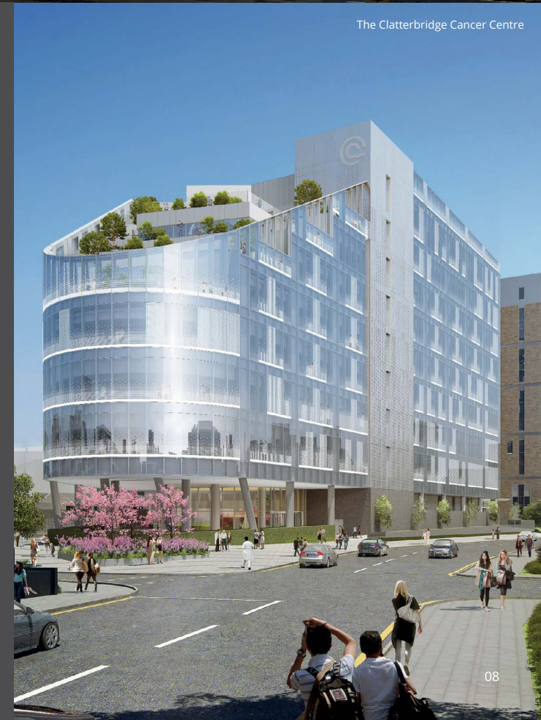
The Clatterbridge Cancer Centre

The development framework also proposes an easy-access link bridge, which will connect the site directly to the heart of Paddington Central.