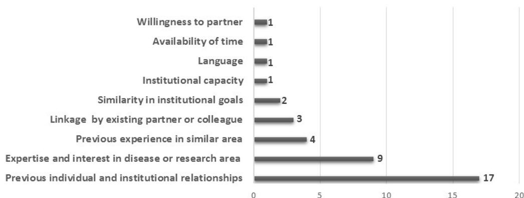
Figure 3 Partner selection criteria used and the number of publications that mention criteria.

to nurture effective relationships was also noted. 49 74–76 Almost half of the papers (n=21) reported encountering challenges when partner differences were not acknowledged and monitored. 26 29 49 68 73–76 At the same time, the investment required (in time and other resources) and practical challenges of building relationships were recognised, particularly when partners were spread across continents. 29 42 50 63 69 77 78 As demonstrated in one study, participants ‘found the process of establishing relationships and reaching consensus... laborious and at times negotiation-intensive’ (p. 4). 63 One consortium shared their learning: